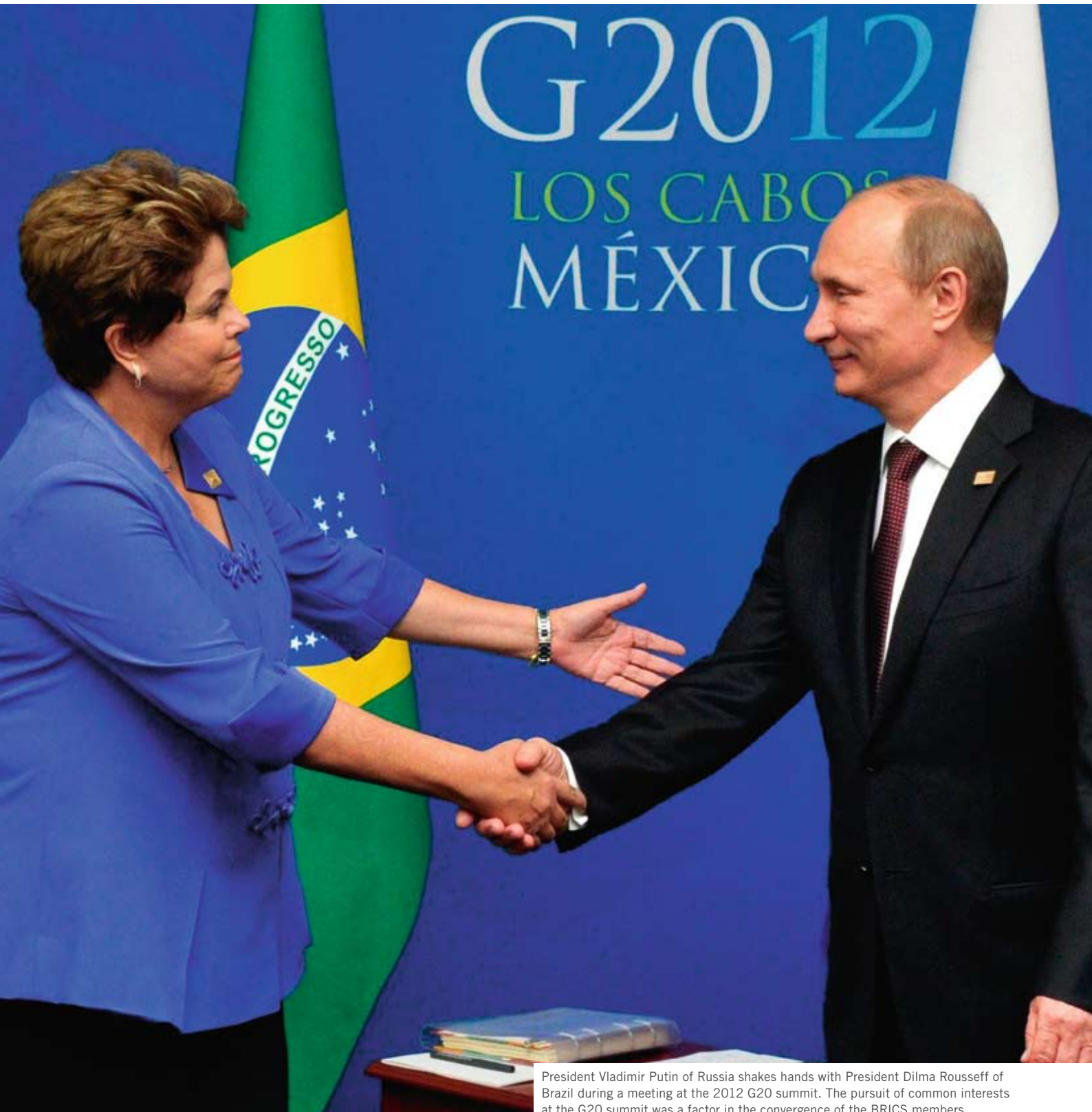
President Vladimir Putin of Russia shakes hands with President Dilma Rousseff of Brazil during a meeting at the 2012 G20 summit. The pursuit of common interests at the G20 summit was a factor in the convergence of the BRICS members