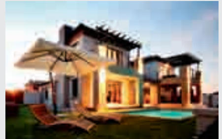
Luxury high-end living facilities are a focus for Nu-Hold

Krisp Properties Commercial is currently developing a business park