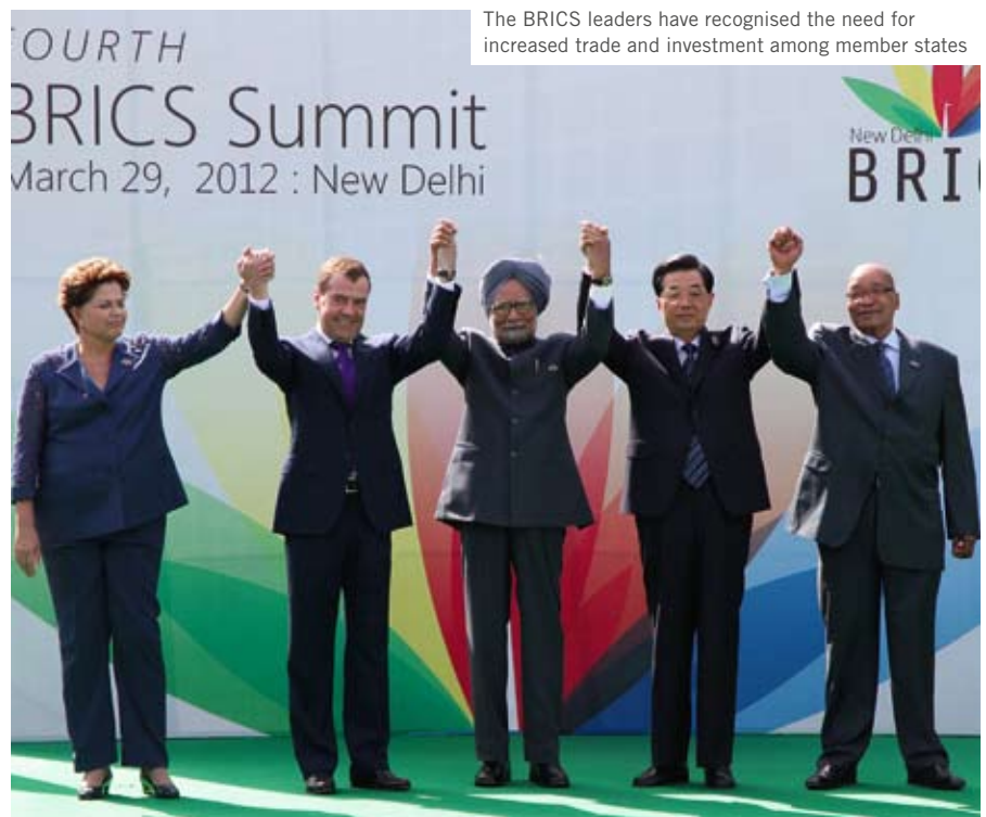
The BRICS leaders have recognised the need for increased trade and investment among member states

It goes without saying that FDI needs a suitable environment in order to thrive and this speaks to the investment climate in the BRICS countries. The legal and regulatory environments wherein investment occurs vary among the countries; some issues are specific to individual countries and some are common to all the BRICS. According to the World Economic Forum's Global Competitiveness Report 2012-13 , individual BRICS countries have particular challenges in areas such as labour market efficiency, infrastructure, institutions and financial market