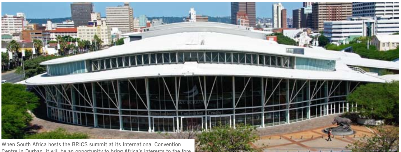
When South Africa hosts the BRICS summit at its International Convention Centre in Durban, it will be an opportunity to bring Africa's interests to the fore