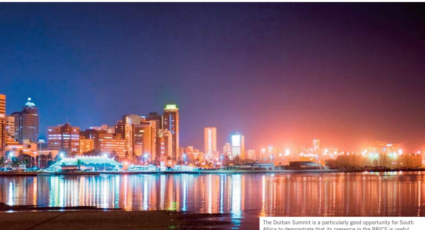
The Durban Summit is a particularly good opportunity for South Africa to demonstrate that its presence in the BRICS is useful

Brazil needs to improve the performance of its non-commodity-producing economy (as does Russia even more), in terms of competitiveness and productivity. Russia also needs