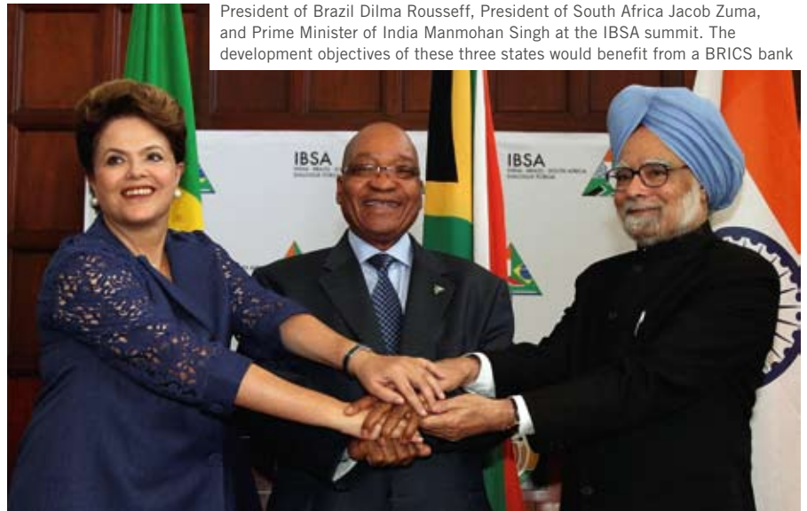
President of Brazil Dilma Rousseff, President of South Africa Jacob Zuma, and Prime Minister of India Manmohan Singh at the IBSA summit. The development objectives of these three states would benefit from a BRICS bank

It will take some time to get the BRICS bank off the ground, although it will reportedly be launched politically, on paper, in Durban. Apart from the feasibility study findings, which are yet to be released, there are numerous questions pertaining to its governance structure and leadership, shareholding and funding levels, and how it will relate to existing development finance institutions in different regions. The impetus behind the BRICS development