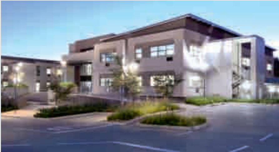
The Nu-Hold group of companies has a presence in every aspect of property development