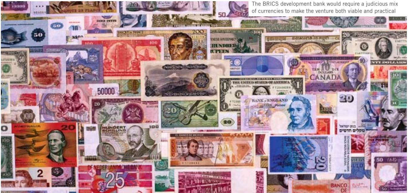
The BRICS development bank would require a judicious mix of currencies to make the venture both viable and practical